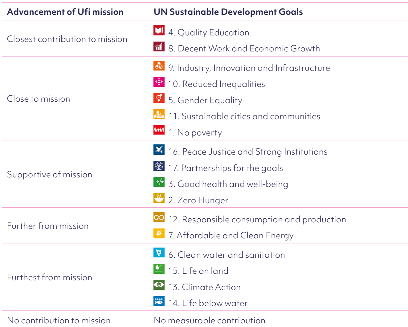
Table 1: Alignment with Ufi mission